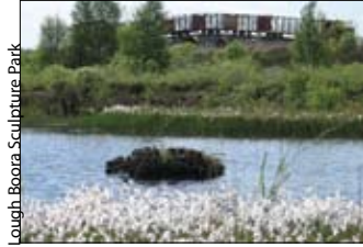
Lough Boora Sculpture Park

Early evidence of human habitation in Ireland leads us back over 8,000 years ago to the shores of Lough Boora, only twenty minutes from Tullamore. Tullamore today has a population of some 13,000 and is the county town of Offaly and an important centre for Midland businesses.