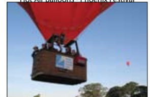
Hot Air Balloons - Phoenix Festival

Phoenix Festival - Mid July Extreme, Art & Heritage Events