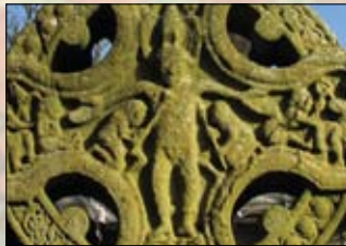
Durrow High Cross

The name Tullamore is derived from the Irish 'An Tulach Mhór' meaning 'the Big Hill'. The area lies in the ancient district of 'Fear Ceall' which has been translated as 'men of the woods' or 'men of the churches' and the region is famous for its monastic centres at Clonmacnois, Durrow, Rahan, Lynally, Clareen and Birr. The original monastery at Durrow, just outside Tullamore was founded by Saint Columba in 553.